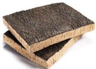
Raw materials 204.8 M€