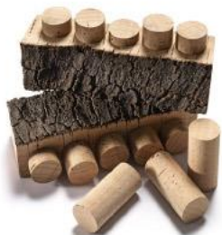
Cork stoppers 559.1 M€