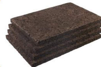
Insulation cork 14.2 M€