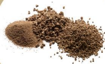
Cork composites 104.5 M€