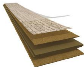
Floor and wall coverings 108.6 M€